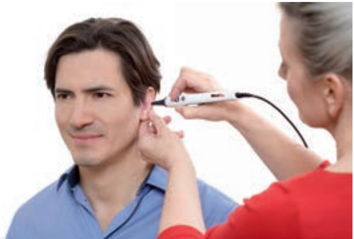
View the Probe Microphone Tube in the Ear Canal.