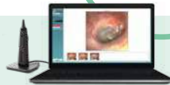
Viot™ Video otoscope