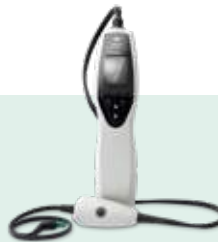
Titan Middle ear analyzer