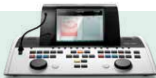
AC40 Clinical audiometer