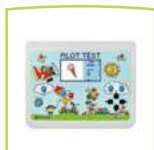
PILOT TEST device