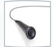
Patient response switch