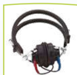
DD45 with HB7 headband