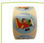
Roll of stickers