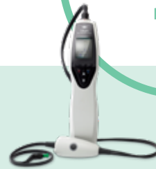
Titan Middle ear analyzer