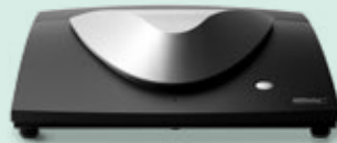
Affinity 2.0 The integrated fitting solution